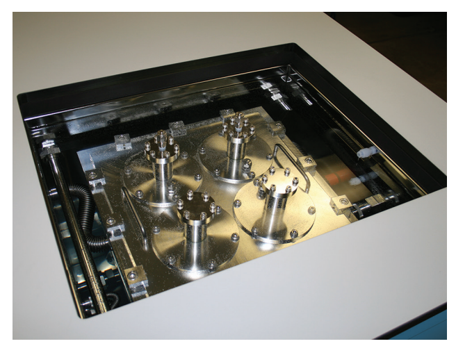
Four Port Option Shown

adapters. The test chamber can accommodate various solid state sensors, chilled mirror hygrometers, as well as material samples for environmental testing. Virtually any humidity and temperature may be generated, for long periods of time, within the operational limits of the generator. The output or recording of the device under test may then be compared with the generator's data for analysis.