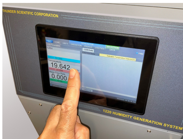
Multi-point Touch Screen for quick and easy data inputs.

Calibration: Proper calibration of the temperature and pressure transducers ultimately determines the accuracy of the generator. The humidity generator employs an integrated software calibration scheme allowing the 1220's probes and transducers to be calibrated while they are electrically connected to the humidity generator. Coefficients for each transducer are calculated by the computer and stored to memory.